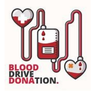
There will be no Blood drive for February.