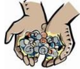
tithes and offerings

There will be an offering today for Sojourner Truth.